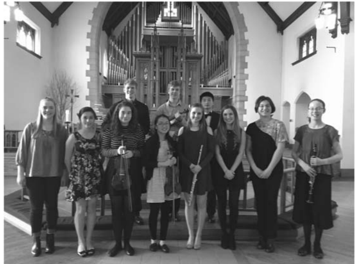
Student performers at the February 5 th 1:30 pm Young Artists' recital