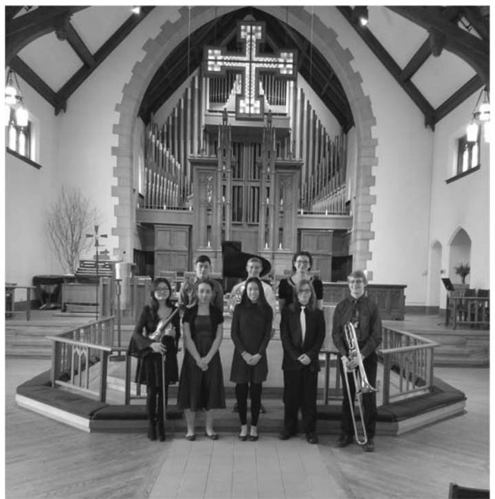
Student performers at the February 4 th 1:30 pm Young Artists' recital