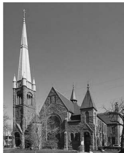
First Congregational Church