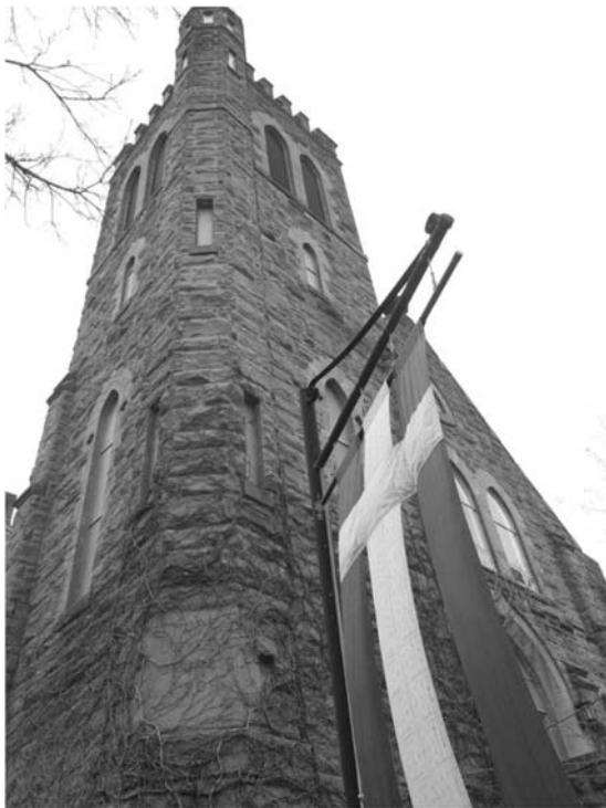
University Lutheran Church of Hope Minneapolis, MN