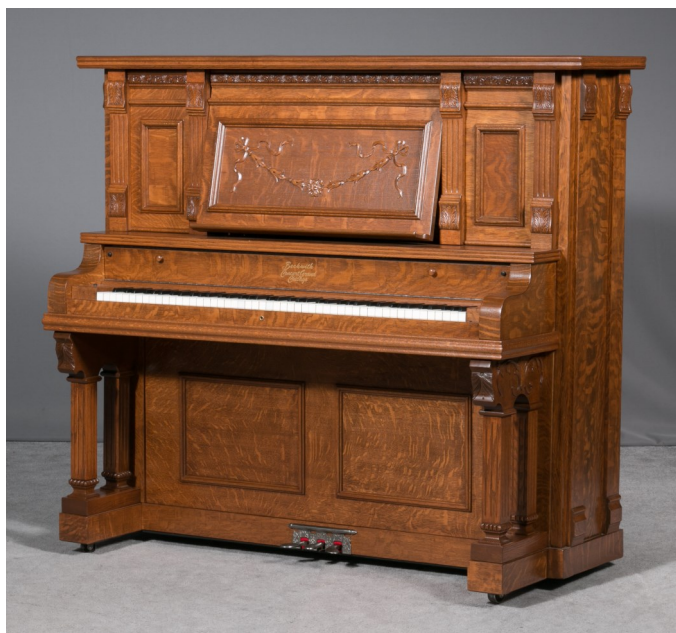
Beckwith Acme Grand Concert Piano (1898)