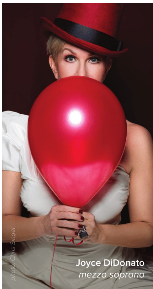
Joyce DiDonato mezzo soprano